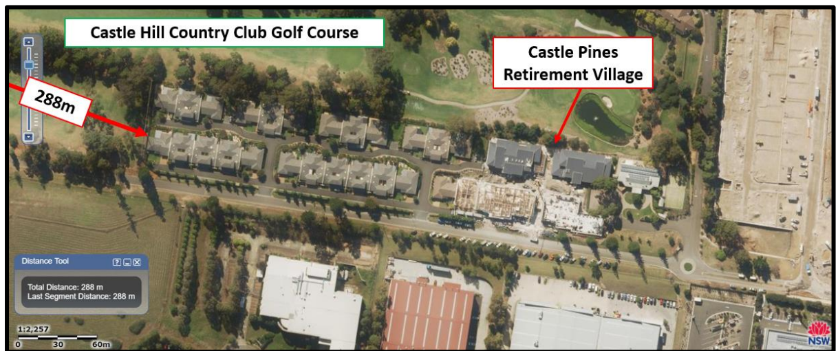
Figure 2: Site Aerial demonstrating the scale of Castle Pines Retirement Village.

Approval for the construction of 95 apartments across 7 buildings for seniors housing has been approved on Bayview Golf Course and will be located approximately 481m from the Bayview Golf Club (registered club) on site. The seniors housing development will be adjacent to land zoned for urban purposes across Cabbage Tree Road in order to be integrated with the surrounding urban development. The site is not considered to be isolated.