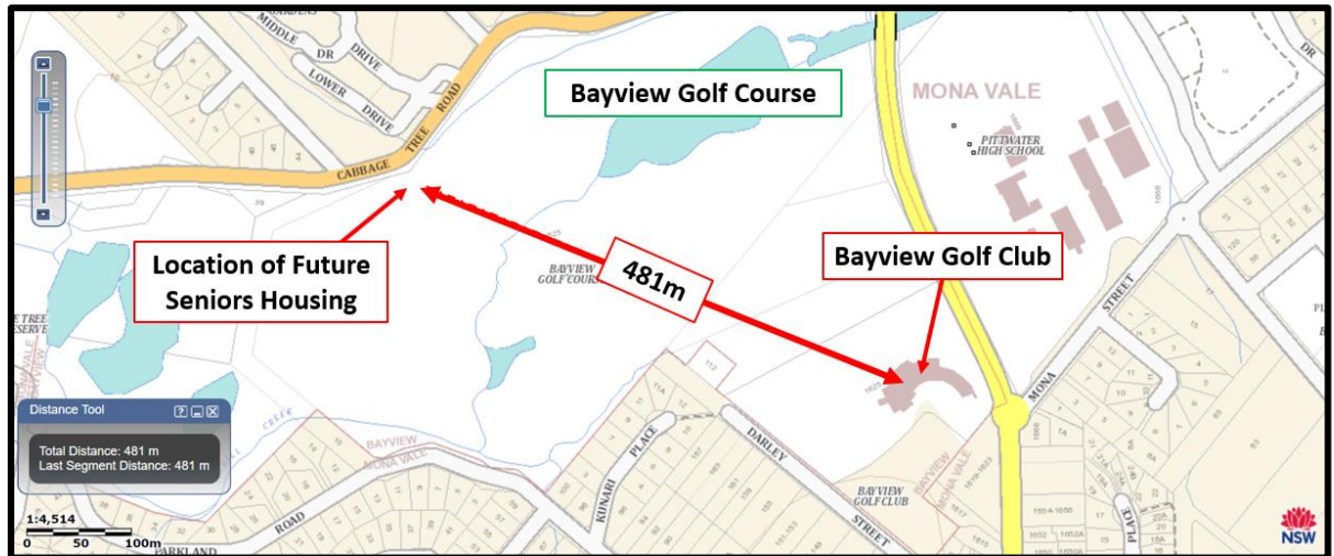
Figure 3: Location Plan demonstrating the approximate location of a future retirement village.